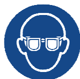
Tightly sealed goggles